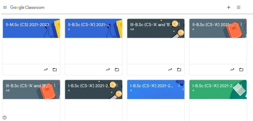
Fig. 1: Homepage screen of online learning

In the experimental group, students were informed about blended learning and they were introduced how to use online learning. In this research, Google Classroom is used as a Learning Management System (LMS). In this web, before login to the system, students have to register themselves by creating an account on Google classroom as in Figure 1below