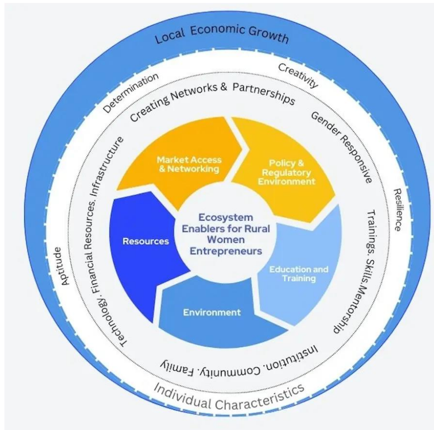
Figure 1.3 : Eco System Enablers for Rural Women Entrepreneurs